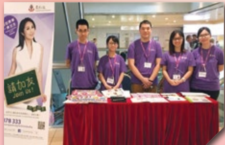
◀ 各區路展活動推廣「東華之友月捐計劃」。Roadshows were held across various districts to promote the "Friends of Tung Wah" Monthly Donation Scheme.

Our special thanks go to Kornhill Plaza, Laguna Plaza, Metro City Plaza, Shun Tak Centre, Sunshine City Plaza and Times Square for sponsoring the roadshow venues.