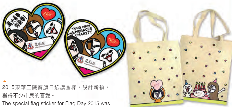
◀ 人氣插畫家 Plastic Thing 設計的限量版悠閒袋 A limited-edition tote bag designed by Plastic Thing, a famous illustrator

2015 東華三院賣旗日紙旗圖樣，設計新穎，獲得不少市民的喜愛。 The special flag sticker for Flag Day 2015 was well received by the public.