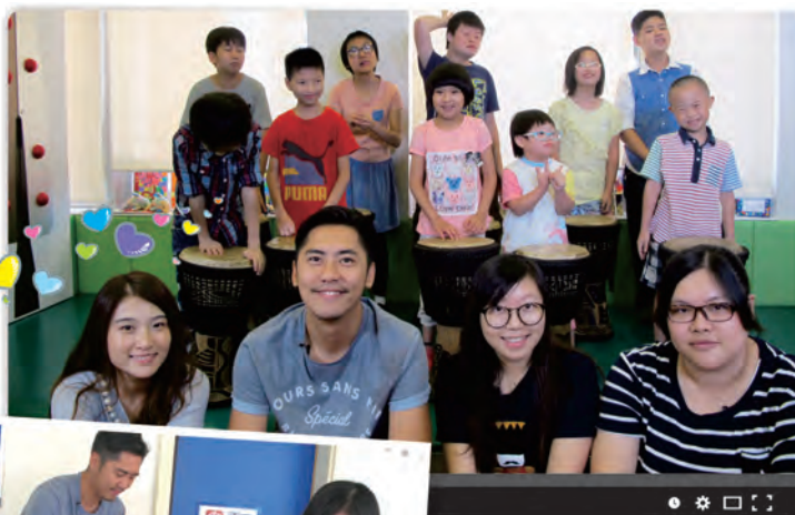
參加者與宿生打成一片。 The participants got along well with the resident students.