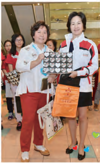
▲何超瓚主席（左）及戊子年總理何超瓊太平紳士親身支持東華三院賣旗日。 Ms. Maisey HO (left), the Chairman, and Ms. Pansy HO, JP, Director 2008/2009, supported the TWGHs Flag Day.