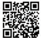
第八集短片二維碼 Video QR code for Episode 8