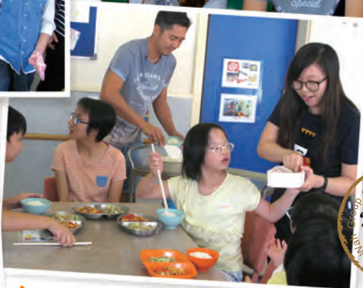
參加者細心了解宿生的進食需要。 The participants listened carefully the dietary needs of the resident students.