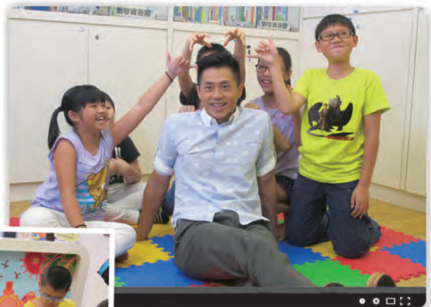
▲ 森美於中心內與小朋友渡過愉快的時光。 Mr. Sammy LEUNG had a delightful moment with children at the Centre.

善事大使：森美 TWGHs Charity Ambassador: Mr. Sammy LEUNG