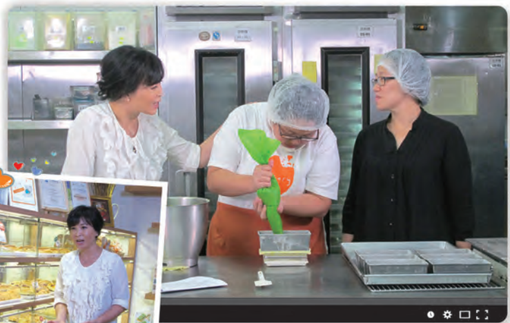
蘇玉華小姐（左一）到訪位於堅尼地城的iBakery愛烘焙麵包工房。 Ms. Louisa SO (left 1) visited iBakery in Kennedy Town.

善事大使：蘇玉華小姐 TWGHs Charity Ambassador: Ms. Louisa SO