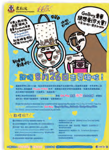
精美活動海報 An attractive campaign poster

To capitalize on the special edition flag sticker of TWGHs Flag Day 2015, a "GoBuy Tung Wah Flag, GoCreate Design Competition" was organized to invite the public to showcase their creativity through charitable deeds. The participants used the flag sticker to create a design with the theme "Celebrating the 145th Anniversary of TWGHs" and uploaded an image of their creation to social media platforms.