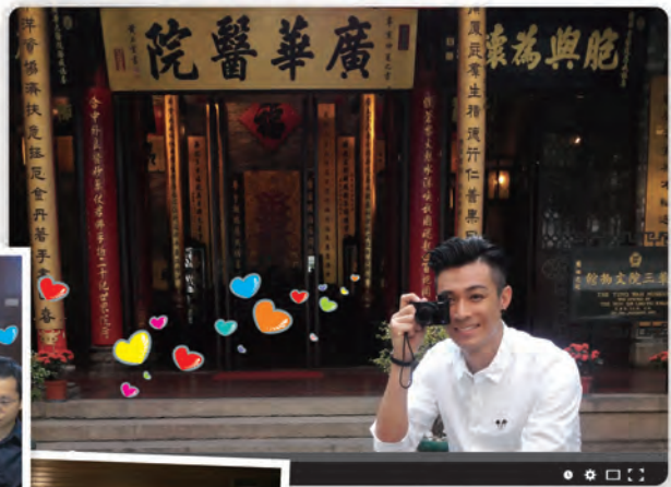
▲ 周柏豪先生到訪東華三院文物館。 Mr. Pakho CHAU visited the Tung Wah Museum.