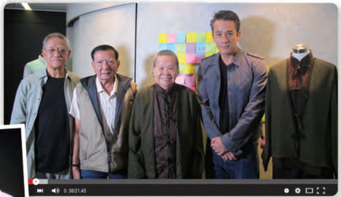
吳耀漢先生（左一）及吳嘉龍先生（右一）到訪東華三院位於觀塘的「生命部落」，了解其「圓滿人生服務」。 Mr. Richard NG (left 1) and Mr. Carl NG (right 1) visited the TWGHs "Life X" in Kwun Tong to explore the "Endless Care Services".

善事大使：吳耀漢先生及吳嘉龍先生 TWGHs Charity Ambassadors: Mr. Richard NG and Mr. Carl NG