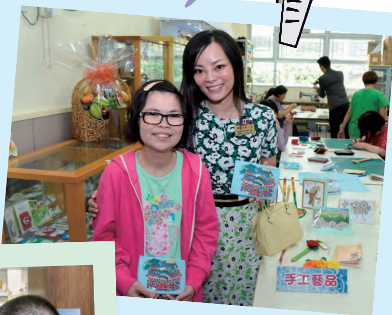
董事局成員巡視東華三院賽馬會復康中心內的各個服務單位。 Board Members visited various service units in TWGHs Jockey Club Rehabilitation Complex.