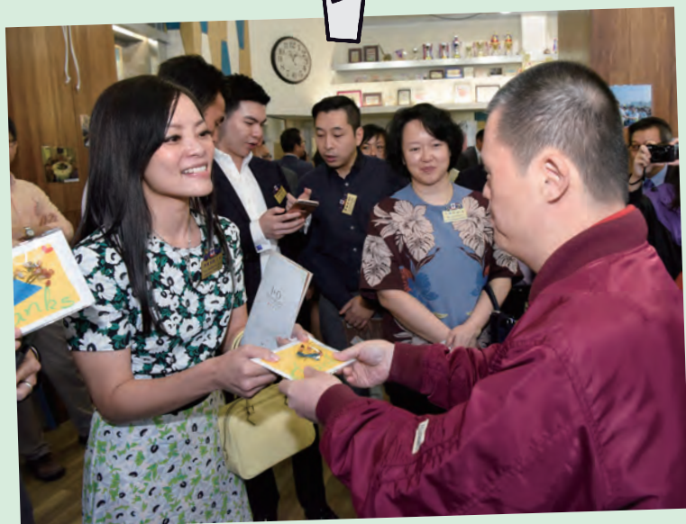
董事局成員巡視東華三院樂群地區支援中心。 Visit of TWGHs Lok Kwan District Support Centre by Board Members.