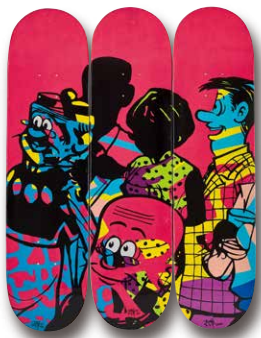
《你今日點呀!?》 王澤II 2020，壓克力彩，一組三件

How's your day!? by Joseph WONG 2020, Acrylic, Set of Three