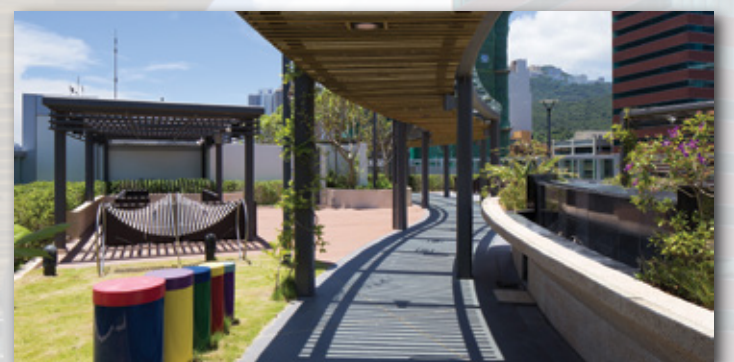
▲ 東華三院賽馬會復康中心擴建項目榮獲「優質建築大獎2016」優異獎及「最佳園林大獎2016」優異獎。 The extension work of TWGHs Jockey Club Rehabilitation Complex attained merit awards in the “Quality Building Award 2016” and the “Best Landscape Award 2016”.

The second one is the joint-venture redevelopment project with New World Development Co. Ltd. at 1-10 Kwai Fong Street. The work involves a premium residential complex located in Happy Valley. The completed construction comprises a 26-storey residential building with private club amenities. The Building, which was designed to blend into the surrounding environment, bears sustainability and harmonious aesthetic in mind.