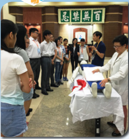
▲ 東華三院萬國殯儀館及東華三院鑽石山殯儀館駐館的禮儀化妝師，向學生示範為先人穿著壽衣的步驟。 Body make-up artist of TWGHs International Funeral Parlour and TWGHs Diamond Hill Funeral Parlour demonstrated the steps of wearing shrouds.