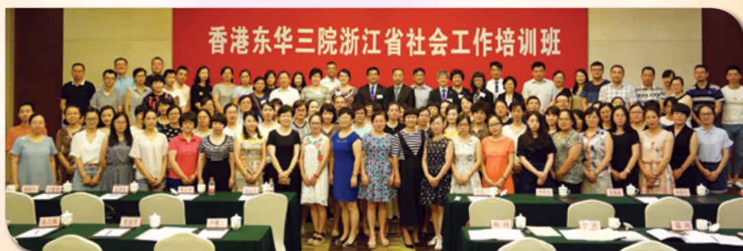
◀ 八十五位來自浙江省各市的社會工作者參加由訪問團講授的培訓班。Eighty-five participants joined the Zhejiang Social Work Training Programme lectured by the Delegation.