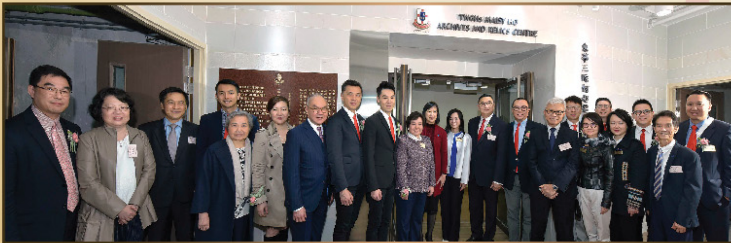
▲ 董事局成員及嘉賓合照 A group photo of Board Members and guests

The Centre opens a new chapter for the Group's heritage preservation work. Covering 640 sq. m., the Centre houses an archive room and a relic room, as well as a conservation workshop, a digital studio, and a reading room, providing the TWGHs collection with a safer and more stable storage environment while offering ample space for more sophisticated relic restoration and research work. At the same time, the Centre allows TWGHs employees and external parties easy access to the historical documents, so that the Group's valuable heritage can be passed on through the sharing of historical archives.