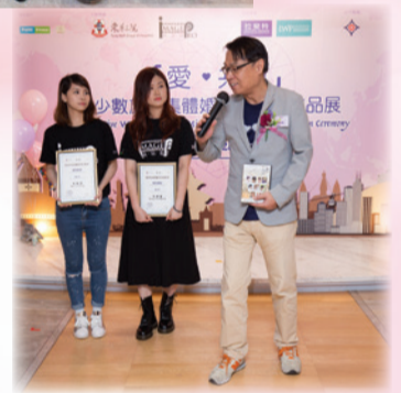
▲ 李力持導演 (右一) 頒發「優秀學員獎」，勉勵年青人繼續堅持追夢。 Mr. LEE Lik Chee (right 1), a notable film director, presented the "Best Trainee Award" and delivered a sharing at the Event.