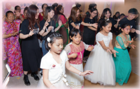
▲ Image Pro 學員與尼泊爾朋友一起跳傳統舞蹈，將當晚活動氣氛推至高峯。 Graduated trainees danced with Nepalese friends at the end of the Event.