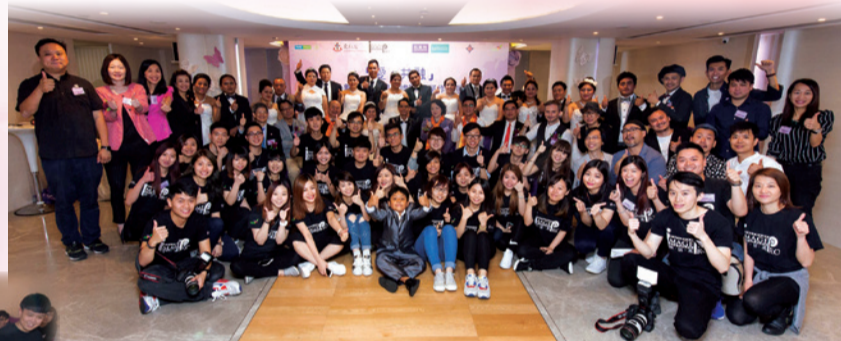
▲ 嘉賓與畢業學員及十對尼泊爾夫婦合照 A group photo of guests with graduated trainees and 10 Nepalese couples