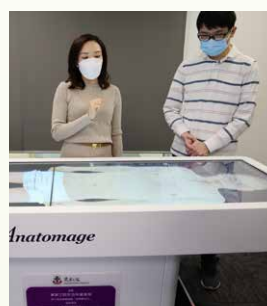
「虛擬實境教學解剖台」 The “Anatomage Table”

The TWGHs Board of Directors 2021/2022 donated $1.08 million to Tung Wah College (TWC) for the purchase of an “Anatomage Table” and a “BodyMap VR Anatomy Learning System” to be used at the Health Care Laboratory in order to enhance the College's teaching facilities and learning effectiveness for better development of nursing and allied health programmes. The Equipment Unveiling Ceremony was held online this month in recognition of the generous donation made by the Board of Directors.