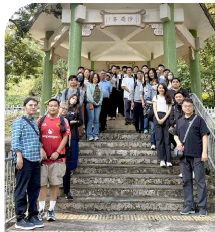
考察團參觀沙嶺墳場及開平自力村碉樓群等多個與近代中國華僑華工歷史相關的歷史古跡。 The Delegation visited Sandy Ridge Cemetery and Kaiping Diaolou and Villages, along with several other historical sites associated with the modern history of overseas Chinese and Chinese labourers.