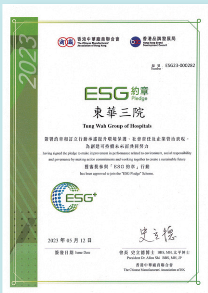
本院參與「ESG約章」行動2023。 The Group has participated in the “ESG Pledge” Scheme 2023.