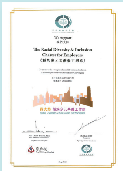
本院支持平等機會委員會《種族多元共融僱主約章》。 The Group supports “The Racial Diversity & Inclusion Charter for Employers” of the Equal Opportunities Commission.

The Group is committed to promoting equal opportunities and eliminating discrimination in respect of sex, disability, marital status and race. We have signed “The Racial Diversity & Inclusion Charter for Employers” to support racial diversity and equality in the workplace. Moreover, the Group has participated in the “ESG Pledge” Scheme 2023, striving to implement sustainable development principles and create a sustainable future.