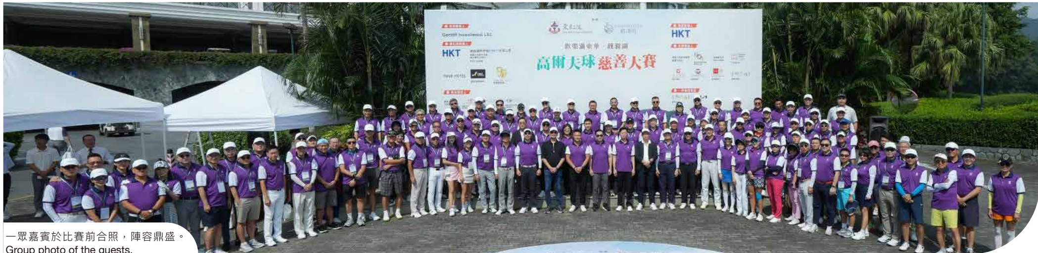
一眾嘉賓於比賽前合照，陣容鼎盛。 Group photo of the guests.