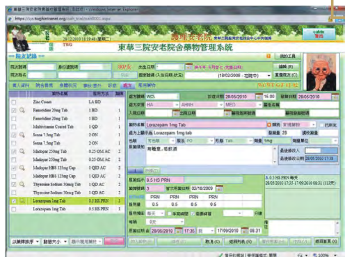
Tung Wah Group of Hospitals - Elderly Home Management Information System. 東華三院安老院舍管理系統。

根據前階段於船灣安老綜合中心中央藥房採用現成軟件的成功經驗，現已為使用者度身設計一個全新應用系統，結合院友個人資料、安老住院、醫療保健、諮詢及病歷等綜合管理。新系統除處理日常藥物資訊外(包括單一劑量與非單一劑量配劑程序)，還為保健員、護理員、配藥員和藥劑師等相關操作員工提供準確與實時資訊，簡化出入院舍手續、健康評估、安全監控、診治、安老院舍監督及行政等工作。