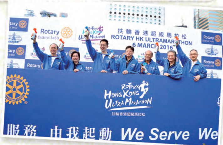
▲ 食物及衛生局局長高永文醫生BBS太平紳士（左四）、何超蕙主席（左二）及嘉賓主持開步儀式。 Dr. the Hon. KO Wing Man, BBS, JP (left 4), Secretary for Food and Health, Ms. Maisy HO (left 2), the Chairman, and guests officiated at the Kick-off Ceremony.