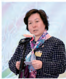
「燃亮燭光」企業關懷行動正式啟動，邀請企業義工為社區上的弱勢社群舉辦生日會。 The "Light the Candles" Corporate Social Responsibility Campaign, was kicked-off to encourage corporate volunteers to organize birthday parties for the disadvantaged.