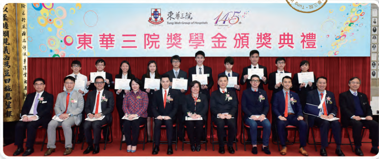
▲ 名譽校監何超蕙主席（前排右六）、董事局成員及得獎學生合照 A group photo of Ms. Maisy HO (front row, right 6), the Chairman cum Honorary Supervisor, Board Members and awardees