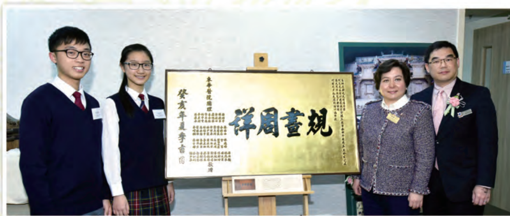
▲ 文物修復工作示範 Demonstration of conservation work