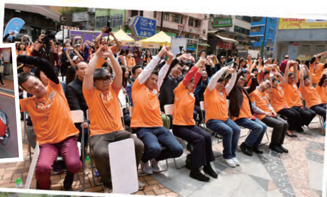
電車及老爺車巡遊 The Tram and Classic Car Parade