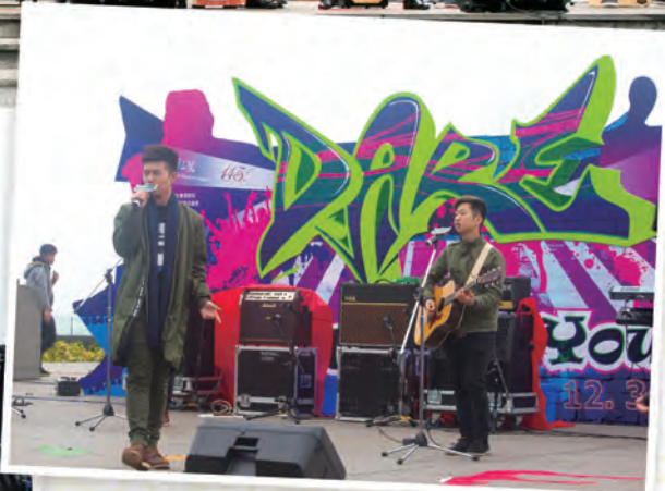
樂隊的精彩表演獲得全場熱烈的掌聲。 The great performance by the bands drew enthusiastic applause.