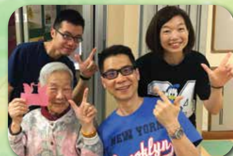
▲ 不同才能的服務使用者、家屬及職員聚首一堂，攜手探索撕紙藝術。Families, staff members and service users with different abilities explored paper tearing art together.