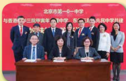
▲ 董事局成員出席與北京一零一中學（左圖）及北京中關村中學（右圖）的簽約儀式。 Board Members attended the Agreement Signing Ceremonies with Beijing 101 Middle School (left) and Beijing Zhongguancunzhongxue (right).

During their stays in Beijing between 24 and 28 September 2016, teachers and students of the 2 TWGHs schools also visited important destinations, including the Capital Museum, Tsinghua University, the Summer Palace and the Chinese Space Museum, among others.