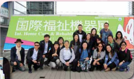
▲ 交流團於東京國際福祉機器展覽會合照 A group photo of the Delegation at the International Home Care and Rehabilitation Exhibition

A delegation consisting of 17 service management staff from the Community Services Division went on a study tour to Tokyo, Japan from 10 to 15 October 2016 to attend Asia's leading International Home Care and Rehabilitation Exhibition which showcased the newest designs for rehabilitation equipment from all over the world to familiarise themselves with the latest and advanced technological facilities, designs, medical and rehabilitation equipment or products for the elderly and people with disabilities. The Delegation visited the Kashiwa-no-ha Smart City, an intelligent city designed to address the needs of an ageing population and Cyberdyne Studio, a major developer of advanced robotic technologies.