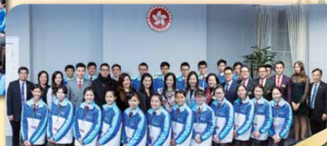
參訪團亦有到訪香港駐倫敦經濟貿易辦事處。 TWGHs Student Ambassadors also visited the Hong Kong Economic and Trade Office in London.