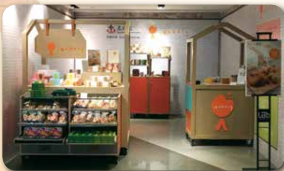
▶ 新的iBakery曲奇專賣店位於金鐘廊Lab Concept，接觸更多新顧客。The new pop-up store was located at Lab Concept in Queensway Plaza to enhance public awareness about iBakery and to reach out to more customers.

iBakery獲邀於11月1至19日在金鐘廊Lab Concept開設曲奇專賣店，將產品介紹予更多新顧客。iBakery更安排將新出版的《不完美的曲奇》繪本，以曲奇禮品包方式率先在該新店推出，並為顧客提供尊享優惠。《不完美的曲奇》禮品包包括《不完美的曲奇》繪本、繪本主角口味的曲奇及以可愛的「卒卒鳥」造型的薑餅，讓大家邊讀邊吃，分享iBakery的共融理念。