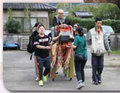
▲ 團員享受和專注於紗織樂。The Delegation enjoyed Saori weaving in the Tokyo Workshop.

A group of 22 i-dArt members, composed of 10 people of different abilities, their families and staff members participated in a Japan Art Tour from 9 to 13 October 2016. In Tsukuba, the Delegation visited the Jinenjo Club. Despite the language barrier, the delegates participated in Taiko-drum playing, dancing, ceramics making, painting and harvesting sweet potatoes from the field together with their Japanese counterparts. In Tokyo, the Delegation visited the Art and Universe Exhibition at the Mori Museum and practiced weaving in the Tokyo Saori Workshop. The tour did more than help its members experience Japan and create lasting memories, it also allowed the differently abled members to cultivate their potential.