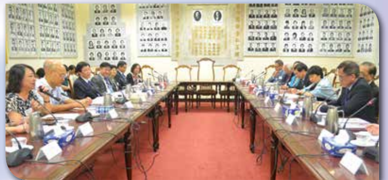
▲ 東華三院代表與GAPSK北京參訪團進行學術交流，分享兩地普通話教學的心得。TWGHs representatives and the Beijing delegation of GAPSK exchanged views on Putonghua education.