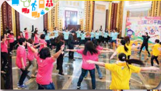
▲ 員工於「東華·躍動」工作坊享受運動的樂趣。 Staff members were having fun in "Street Workout Workshop".