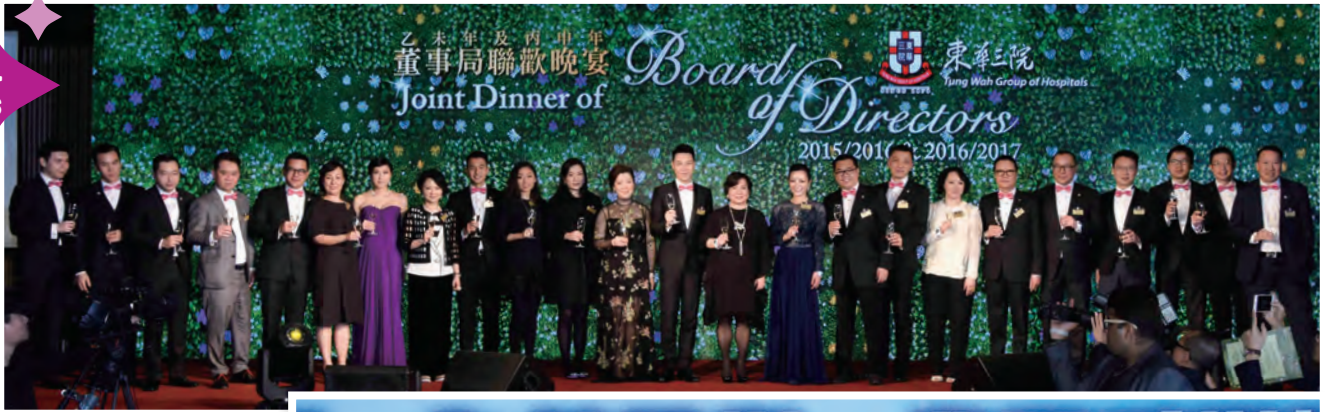
乙未年及丙申年董事局成員向嘉賓祝酒及合唱145周年主題曲《善在必行》。The Boards of Directors 2015/2016 and 2016/2017 toasted to guests and sang the 145th Anniversary theme song.