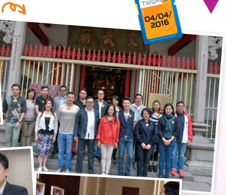
董事局成員到訪廣福義祠、文武廟、東華義莊及東華三院馮堯敬醫院。 Board Members visited Kwong Fook I-tsz, Man Mo Temple, Tung Wah Coffin Home and TWGHs Fung Yiu King Hospital.