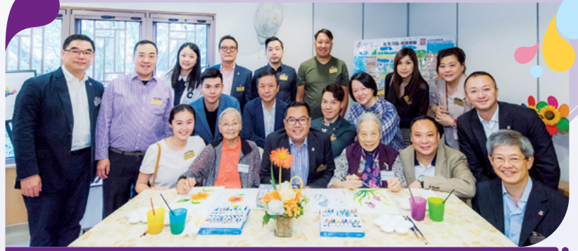
董事局成員參觀東華三院賽馬會松朗安老綜合中心。 Board Members visited TWGHs Jockey Club Sunshine Complex for the Elderly.