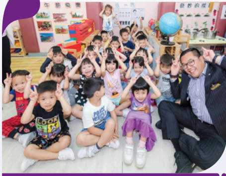
董事局成員巡視東華三院蕭旺李滿福幼兒園。 Board Members paid a visit to TWGHs Shiu Wong Lee Moon Fook Nursery School.