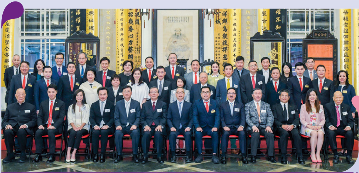
民政事務局長暨東華三院顧問局主席劉江華太平紳士（前排右七）與顧問局成員、前任主席及董事局成員合照 A group photo of the Hon. LAU Kong Wah, JP (front row, right 7), Secretary for Home Affairs cum Chairman of the TWGHs Advisory Board, with Members of the Advisory Board, former Chairmen and Board Members

Situation reports on TWGHs policy issues, significant matters and undertakings, as well as major activities held, were compiled and submitted to the Advisory Board on a quarterly basis to strengthen communication between the Advisory Board and the Board of Directors, and to enhance the transparency of the Group's operations.