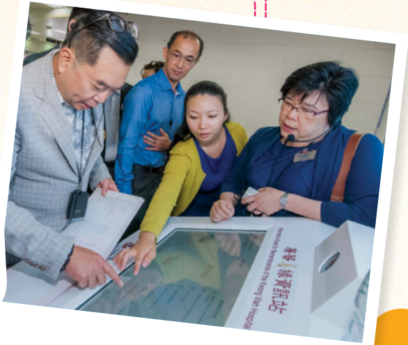
1 廣華醫院 Kwong Wah Hospital