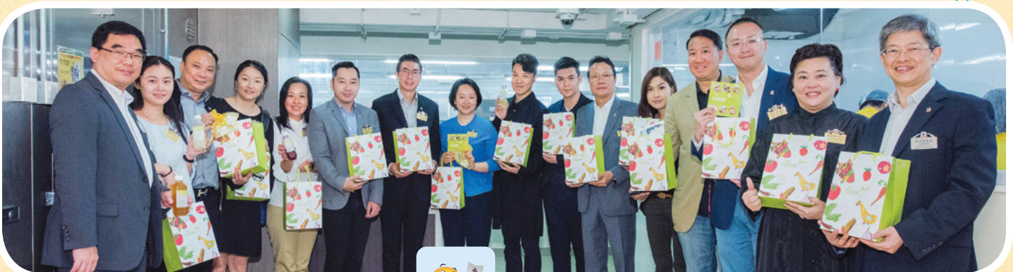
東華三院煮餸易生產中心 TWGHs CookEasy Production Centre