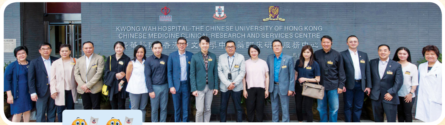
2 廣華醫院—香港中文大學中醫藥臨床研究服務中心 Kwong Wah Hospital-The Chinese University of Hong Kong Chinese Medicine Clinical Research and Services Centre