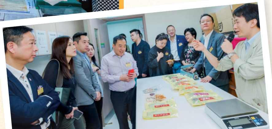
東華三院李恩李銻麟父子中央煎藥中心 TWGHs Lee Yen & Lee Yuk Lun, JP, Father & Son Centralized Decoction Centre