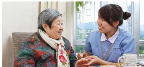
服務券使用者接受本院的專業家居照顧服務。 Service voucher user received professional home care services of TWGHs.

承蒙社會福利署增撥資源，本院安老服務部由2018年10月1日起加強服務資助單位的醫療及專業服務，包括為本院資助安老院舍增加到診醫生服務次數及新增言語治療師服務，以及為長者地區中心、鄰舍中心、長者日間照顧中心及綜合家居照顧服務隊加強認知障礙症支援服務、體弱長者照顧者外展支援服務及新增言語治療師服務。