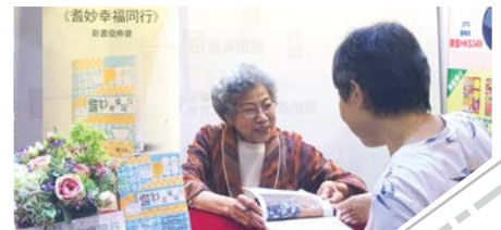
影視名人羅蘭女士出席新書簽名會。 Celebrity Ms. Helena LAW presented at the autograph session.