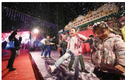
普天同慶天秀墟活動配備飄雪表演 Snowing show of Joy to TWGHs Tin Sau Bazaar

本院今年再獲民政事務總署支持，於2018年12月15日至2019年1月3日期間在東華三院天秀墟舉辦「普天同慶天秀墟」，將充滿本土氣息的大型墟市佈置成為富有異國風情的特色聖誕小鎮，與天水圍及鄰近地區的市民一同慶祝佳節。活動安排了豐富的節目，包括小熊貓3D聖誕奇幻歷險動畫匯演，並配有由飄雪、燈光和音響營造的雪花飄舞效果，另有一系列富公民教育意義的攤位遊戲，如「一帶一路」國家拼圖和民族禮服配對遊戲等，讓參加者從中認識絲綢之路的文化及世界大同的理念。啟動禮於2018年12月14日舉行，邀得民政事務總署署長謝小華太平紳士主禮，與王賢誌主席、元朗區議會主席沈豪傑太平紳士及董事局成員一同為活動揭開序幕。