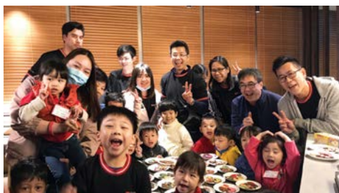
東華三院iBakery透過不同的活動向大眾推廣共融理念。TWGHs iBakery promoted the vision of social inclusion to the public through different activities.

聘用殘疾人士的社會企業東華三院iBakery除了致力為顧客提供優質產品和服務，還藉著不同活動向大眾推廣共融理念，包括有關其目標和營運方針的分享會、共融曲奇班、「不完美的曲奇」讀書會，以及大受大學生歡迎的餐桌禮儀班。iBakery的不同能力人士均會參與每項活動，令參加者親身體驗共融的意義。在過去一年，iBakery為市民舉辦了40節不同的共融教育活動，合共款待了1,000名市民。