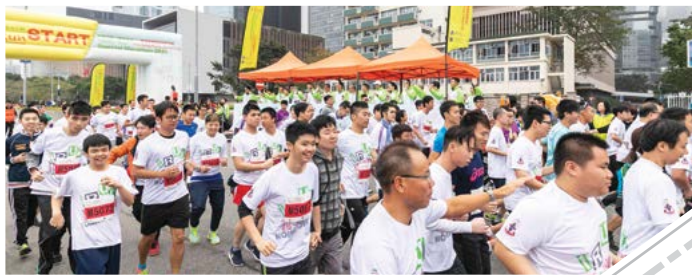
超過4,000名跑手及其伴跑員參與東華三院「奔向共融」。 More than 4,000 runners and their buddies participated in TWGHs “iRun”.

Moreover, TWGHs connected The Chinese University of Hong Kong, 11 secondary schools of TWGHs and different districts with 12 service centres for the disabled to implement the “Inclusion in School” Running Training Programme from September 2018 to January 2019. On the Event day, the students paired up with their disabled training partners to join the Marathon and enhance social inclusion.