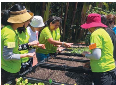
活動參加者體驗種植帶來的快樂和滿足感。 Participants experienced the joy and satisfaction of planting.

「綠色心思」精神健康推廣服務以園藝為途徑，為不同背景的群體提供園藝治療小組、綠色體驗工作坊、社區教育等活動，讓參加者認識自身才能，並推廣良好精神健康的重要性。服務對象包括殘疾人士、精神復康者、認知障礙者、照顧者、青少年、在職人士等。本服務亦獲滙豐香港社區夥伴計劃贊助，舉行「綠色起義——精神健康推廣計劃」，為社區人士提供園藝活動體驗，以改善其情緒和精神健康。