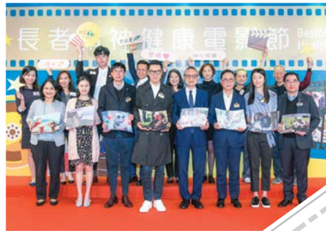
「關注腦朋友」舉辦「長者精神健康」電影節。 “Best 60s” organised “Elderly Mental Health” film festival.

The number of elderly diagnosed with mental health problems and mood disorders have been on the rise in recent years. To enhance public awareness of elderly mental health, and achieve the objective of “Early Identification and Early Intervention”, the Elderly Services Section of the Community Service Division of TWGHs launched the “Best 60s” Elderly Mental Health Community Education Project, through community education videos, organising photo competition and film festival, to encourage the public to care for their seniors and keep them company.