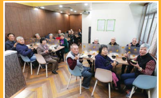
東華三院「膳東軒」為區內長者提供有營養及價格便宜的午餐及晚餐。 TWGHs "Yiu Tung Community Kitchen" provides nutritious lunch and dinner at low prices for the elders in the community.