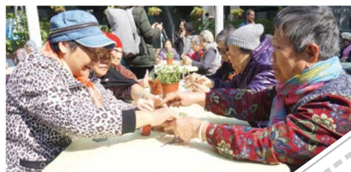
長者享受園藝的樂趣。 Elders enjoyed the fun of gardening.

The “I-Greenery” for Social Inclusion and Mental Health organised gardening programmes for groups with different backgrounds and stories to let them recognise their strengths as well as to promote the importance of positive mind-set. These programmes included horticultural therapeutic groups, green experimental workshops, and community-level promotional events. Among the beneficiaries of the Project were people with physical and mental disabilities, psychiatric rehabilitants, people with cognitive disabilities, caregivers, youths and the working population. Sponsored by the HSBC Hong Kong Community Partnership Programme, the “Green Services - Mental Wellness Scheme” was launched to enhance the emotional well-being and mental health of the community by offering horticultural experience to them.