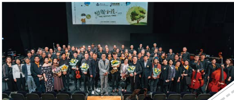
嘉賓與東華三院「E大調合奏團」合照 Group photo of guests and TWGHs "E Major Ensemble"