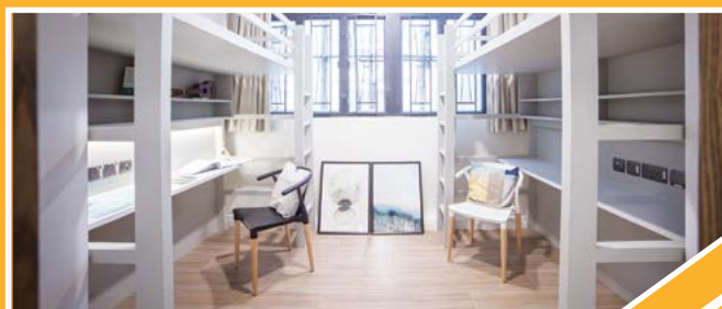
東華三院「福全·共寓」青年共居空間的室內佈置 The outlooks of TWGHs Fortune Loft Youth Co-living Space