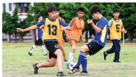
青少年足球領袖與廣州市從化區的青年切磋球技，互相交流。

The 5th “Jockey Club Youth Football Leadership Scheme”, jointly organised by TWGHs, The Hong Kong Jockey Club (HKJC) and Manchester United Soccer School in Hong Kong, aimed to nurture the physical, organisational and leadership skills of the young people, with a view to developing their potential as future community leaders. Sponsored by HKJC, the Scheme recruited young people aged between 15 and 19 to participate in a variety of activities in 7 months, including elementary football coaching courses, life skills workshops, community services and an exchange tour to Guangzhou. The 6 most outstanding young leaders are sponsored to travel to Britain to join matches and community activities organised by internationally-renowned football club Manchester United so as to broaden their exposure and serve the community in return.