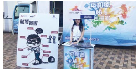
「平和號」宣傳車走訪香港向市民宣揚抗賭信息。 “Ping Wo Cruiser” Publicity Truck travelled around Hong Kong to spread the message of anti-gambling.

With a total funding of $2.5 million provided by Ping Wo Fund under the Home Affairs Bureau, “Ping Wo Cruiser” Publicity Truck Service has been established to offer anti-gambling community education for 18 months starting from June 2018 during FIFA World Cup 2018. With an aim to conduct antigambling programmes at 100 primary, secondary and tertiary schools and visit all the 18 districts of Hong Kong, the Service has already received 80 school applications for Publicity Truck on-site service, and the Truck has visited over 20 hotspots on Hong Kong Island, in Kowloon and in the New Territories.