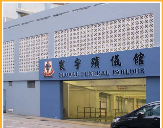
東華三院寰宇殯儀館 TWGHs Global Funeral Parlour