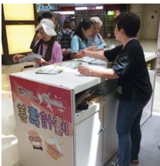
職員為市民解答有關殯儀服務的問題。 Staff member answered public enquiries on funeral services.

TWGHs International Funeral Parlour and TWGHs Diamond Hill Funeral Parlour broke the taboo around death by holding their first life-and-death exhibitions at Tsz Wan Shan Shopping Centre and Sau Mao Ping Shopping Centre in June and November 2018 respectively. The public learnt more about the funeral traditions through interactive booth games. In addition, staff members were arranged to introduce the "Plan Ahead Funeral Arrangement" project of the Group to the visitors, promoting the idea of planning ahead their own funerals and encouraged them to communicate with their loved ones about their preferences on funeral arrangement.