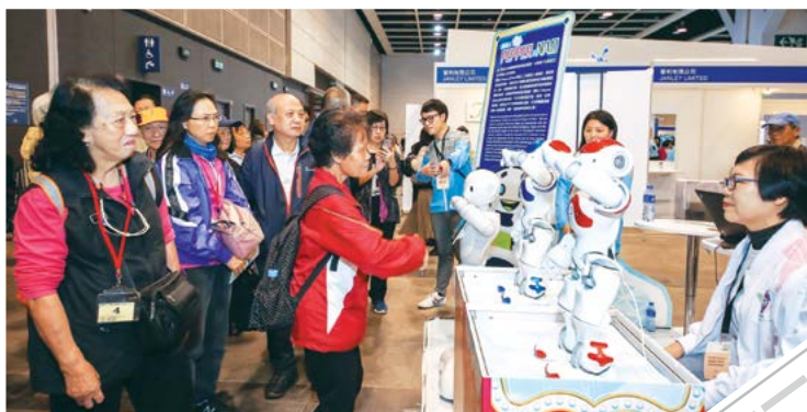
長者對機械人「Nao」的唱歌跳舞表演甚感興趣。 Elders were keenly interested in the singing and dancing performed by robotic "NAO".

TWGHs Elderly Services Section participated in the "Gerontech and Innovation Expo cum Summit 2018" (GIES 2018) organised by the Government of the Hong Kong Special Administrative Region and the Hong Kong Council of Social Service and co-organised by the Hong Kong Science and Technology Parks Corporation from 22 to 25 November 2018 to showcase the innovative IT products used in TWGHs elderly service centres, and introduce how such products enhance elders' living quality and enable them to lead a fulfilling life with happiness and dignity. Products on exhibition included "Body Spider", "Bedside Movement Equipment", "Power Assist Hand", "Anti-strip Jumpsuit", Robotic "NAO", "PEPPER" and "PARO".