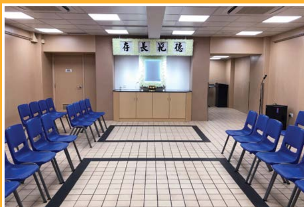
寰宇殯儀館備有大禮堂及靈寢室，豐儉由人。 The Parlour has funeral halls and reposing rooms to suit for different needs.