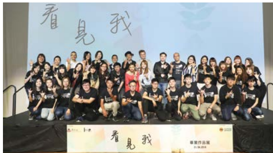
「映像夢啟航計劃」畢業學員與眾嘉賓及導師合照 Group photo of graduates of the "Image P.R.O. (Pride in Re-orientation)", officiating guests and mentors

另外，映誌高於2018年7月開辦為期9個月的第四屆「映像夢啟航計劃」製作助理職前訓練班，幫助對多媒體行業有興趣的青年人發掘潛能，一展所長。