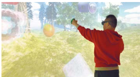
虛擬遊戲體能訓練有效提升服務使用者運動四肢的動力。 Service users are motivated to exercise their upper and lower limbs through VR physical training.

本院屬下賽馬會復康中心設置了體驗式CAVE投影系統，通過虛擬實境為接受復康治療及訓練的服務使用者提供5項不同的互動訓練，包括社區生活技能、體能、認知、情緒調控和探索體驗。虛擬實境技術不但能夠突破傳統訓練方法的限制，例如天氣、環境、人手及體力等，還可以為重複的訓練增添趣味，有助提升服務使用者參與訓練的動力及訓練的效益。