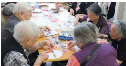
「歷程耆兵」計劃下的長者生死教育小組 Life and death educational group for the elderly under the "Elders' Story" project

承蒙攜手扶弱基金及華人永遠墳場委員會贊助，東華三院圓滿人生服務分別推出「歷程耆兵」計劃及「思前想後」計劃，為不同年齡群提供生死教育，以鼓勵大眾珍惜生命，重視與家人的關係。「歷程耆兵」計劃提供個人人生回顧、社區教育活動及生死教育小組等服務，受惠人數超過20,000人。而「思前想後」計劃則於2018年9月25日至10月2日期間，假賽馬會藝術創意中心舉辦「藝『述』人生畢業禮」展覽，展出超過100件由長者與照顧者一同製作獨一無二的後事藝術品，及在展品旁展示相關的「後事冷知識」，啟發參觀者以不同角度，認識死亡與後事的相關課題。