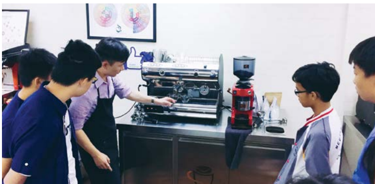
技能提升訓練 Skills exploration classes

TWGHs held a 2-year “Sun Life Navigation Project” from September 2016 to August 2018. The Project provided 33 junior form students with special educational needs (SEN) from 5 secondary schools in Sham Shui Po District with life and career planning trainings, through intensive individual counselling, group gatherings, skills trainings and career visits. Participants were encouraged to enhance their self-understanding and strengthen their connection with schools, family and communities through various activities.