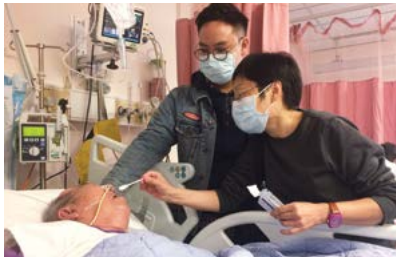
安聯服務團隊悉心照顧晚期病人，讓他有尊嚴地完成人生旅程。 The End-of-Life Care Services Team provided intensive care for terminally-ill patients to complete their life journey with dignity.

The Service also organised over 30 sessions of professional end-of-life care trainings to the service providers of the Group.