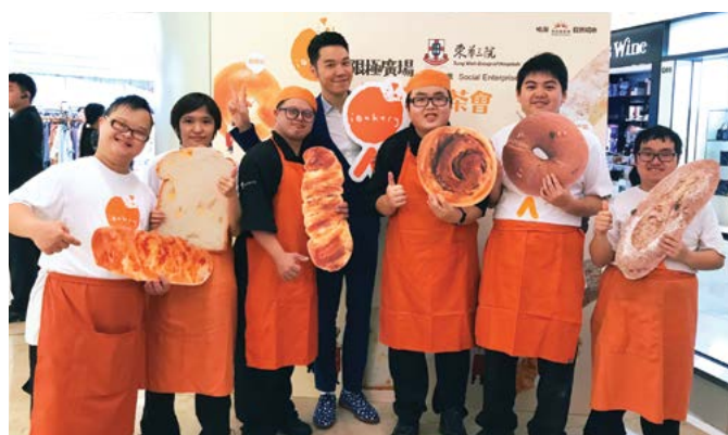
東華三院iBakery獲無限極廣場支持，於無限極廣場設立曲奇專賣店。 With the support of Infinitus Plaza, TWGHs iBakery opened a Pop Up Store at Infinitus Plaza.

This year, iBakery received full support from Infinitus Plaza, and opened its eighth store in May 2018 at the heart of Sheung Wan. The new outlet offered bakery handmade with natural ingredients by people with disabilities to the working population in Sheung Wan. Moreover, iBakery made a crossover with Infinitus Plaza to launch its Christmas 2018 special edition – “One for One Infinite Hearty Gingerbread” cookies pack. For every purchase of a cookies pack, Infinitus Plaza donated an equivalent amount of money to iBakery. Eventually, a total of $130,000 was raised to support its bakery and catering training and employment opportunities for people with disabilities.