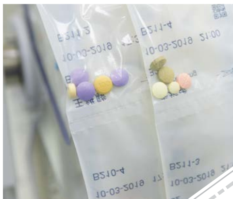
自動藥物包裝 Automatic drug packaging

TWGHs Jockey Club Rehabilitation Complex set up a Drug Management Office and introduced the Computerised Central Drug Management System in August 2018, so as to support automatic drug dispensing, drug verifying and packaging, drug library and stock management. The System helps nurses to shorten drug processing time and reduces chance of manual drug dispensing error, ensuring safe medication for residents. In addition, the Complex established a pharmacological team composed of pharmacists and medicine dispensers to provide trainings on proper use of medicines for nurses and carers, so as to enhance their knowledge on pharmacology.