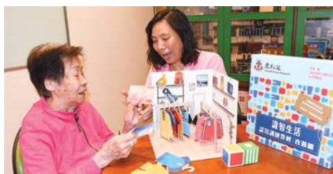
3D立體設計的模擬時裝店有助提升認知訓練的體驗。 3D fashion shop simulation enhances the experience of cognitive training.

確診認知障礙症的人數不斷上升，有研究指出持續的認知訓練有效延緩病情，保持長者的認知能力。有見及此，東華三院渣打香港150週年慈善基金長者智晴坊特別製作「識智生活」認知訓練教材，鼓勵及推動照顧者把認知訓練融入生活。「識智生活」認知訓練教材以「衣」為主題，讓長者透過「購買」衣服進行定向、記憶、計算、專注及手眼協調等認知訓練。教材備有不同程度的訓練，讓照顧者可按長者的能力選擇合適的訓練。