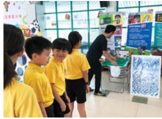
「平和號」到訪小學，並透過「密室逃脫」、「體育X抗賭」及攤位遊戲宣傳抗賭信息。 “Ping Wo Cruiser” visited a primary school to promote anti-gambling through “Room Escape”, “Sport X Anti-gambling” and booth games.