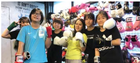
青年人透過泰拳運動小組學習釋放壓力。 Young people learned to release their stress through the kick-boxing exercise group.

由社區投資共享基金資助，為期3年的「Better SHA Teen Café 關顧青少年身心健康計劃」圓滿結束，並於2018年9月8日假置富第一城廣場舉行閉幕禮，邀得社會福利署沙田區助理福利專員陳蕙子女士主禮。該計劃集合醫護界、社福界、商界、家庭、學校及社區人士，在區內建立共同參與的跨界別協作平台，關顧和支援青少年的個別差異和情緒需要，並倡導及早預防和介入有情緒困擾的青少年及其家庭，鼓勵參加者建立良好的生活習慣和人際關係，引導他們成為意志堅強、生活健康、值得欣賞的青年人。該計劃共舉辦了1,400節活動，共有3,200人參與。