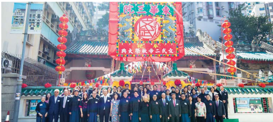
董事局成員與嘉賓於秋祭典禮後在東華三院文武廟前合照 Group photo of Board Members and guests in front of TWGHs Man Mo Temple upon the completion of the Autumn Sacrificial Rites