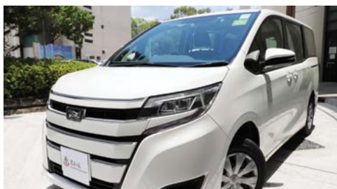
「覆診易」專車為服務使用者提供點對點的接載服務。 "Easy Ride Transportation Service" vehicle provided point-to-point transportation for service users.

「覆診易」長者接送計劃為體弱長者、50歲以上的殘疾人士及其照顧者，提供免費往返沙田及大埔區公立醫院及分區診所的接載服務，以解決他們的交通困難，協助他們按時覆診，減輕照顧者的壓力。