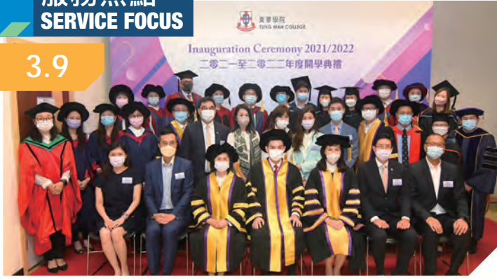
主禮嘉賓於典禮上歡迎新生。 Officiating guests welcomed the freshmen at the Ceremony.