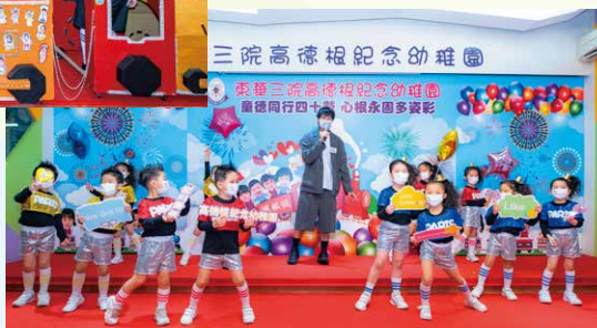
人氣歌手吳業坤先生以校友身份於典禮中演出。 Famous pop singer James Ng performed at the Ceremony as an alumnus of the Kindergarten.