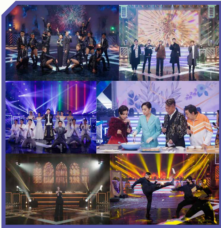
一眾粵劇名伶與演藝紅星於晚會落力演出，為本院籌募經費。 Cantonese opera masters, singers and artistes gave superb performance on that evening to raise funds for TWGHs services.

「歡樂滿東華」是東華三院年度大型籌募項目，為本院醫療衛生、教育及社會服務籌募拓展經費。今年活動以「東華愛傳承」為主題，一系列募捐活動已於2021年11月期間開展，而壓軸電視籌款晚會亦於2021年12月11日在電視廣播城舉行，並於無線電視翡翠台、TVB Facebook專頁及YouTube channel同步播映。全賴各界善長鼎力支持，是次籌款活動為本院籌得破紀錄的123,988,888元善款，讓更多有需要人士受惠。東華三院董事局及冠名贊助人已贊助各項籌募活動的直接開支，活動不會從籌得的公眾善款中扣除行政費用，確保公眾善款全數撥用於本院服務。