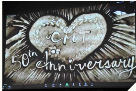
學生於校慶典禮上表演沙畫 Sand painting performed by a student representative

The College puts emphasis on "Whole-Person Development" and students are cultivated for various talents. The theme of the 50th anniversary celebration ceremony was to praise teachers' hard work regardless of challenges, and to nurture brilliant students to contribute to the society. In celebration of the anniversary, guests, alumni and students officiated at the lighting ceremony, symbolizing the spirits of education for moral and academic excellence and commitment to society being passed on.