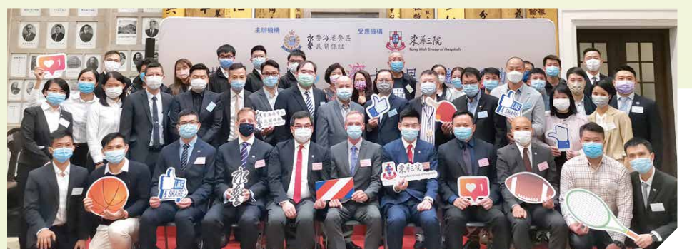
一眾嘉賓、善長及活動參加者聚首一堂，共同分享投入運動和慈善的喜悅。 Guests, donors and participants shared the joy of doing exercise and charity.

Our sincere gratitude goes to the Marine Port District, Hong Kong Police Force for donating HK$163,180 raised in the charity campaign “Islands District Burn Calories Challenge.” Organised by the Marine Port District, the Campaign aimed to encourage those living and working in the Islands District to perform more moderate-intensity exercises. Calories burnt recorded in the mobile app by group and individual sponsors were turned to monetary donations in support of the development of various TWGHs services.