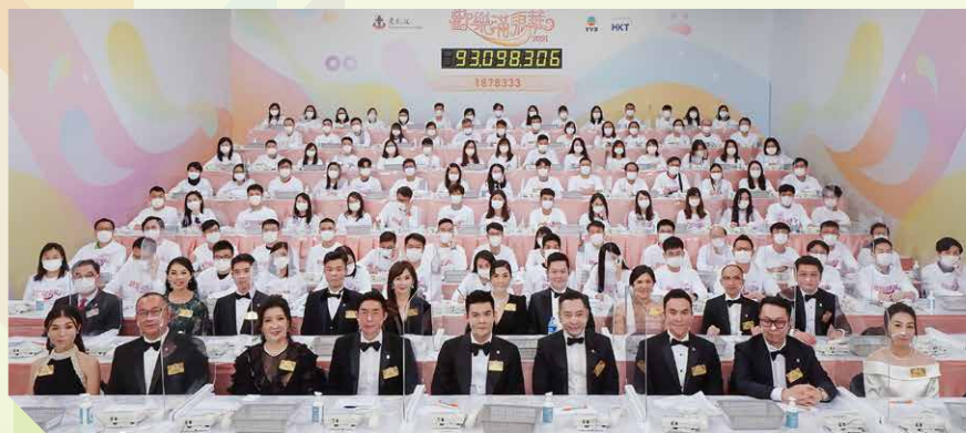
董事局成員在熱線中心為義工們打氣。 Board Members rooted for the volunteers at the donation hotline centre.