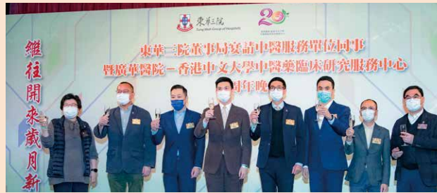
董事局成員進行祝酒儀式。 Board Members had a wine toasting ceremony.