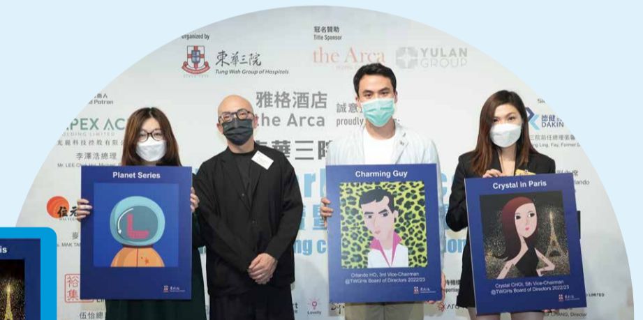
東華三院董事局成員聯同是次活動參與單位代表展示NFT作品，精彩紛呈。 TWGHs Board Members and representatives of participating units presented the enchanting NFT works.