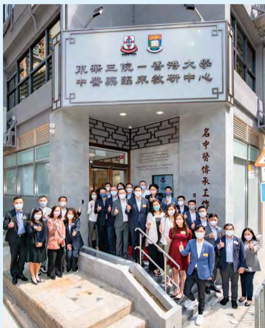
東華三院－香港大學中醫藥臨床教研中心新址 New premises of Tung Wah Group of Hospitals - The University of Hong Kong Clinical Centre for Teaching and Research in Chinese Medicine

The new Centre was officially relocated in early May 2022. It consists of 5 consultation rooms and a Chinese medicine dispensing department to provide Chinese granules, herbal drugs dispensing and decocting services. With a more accessible location and state-of-the-art facilities, the new premises of the Centre provides more convenient and quality services to the elderly and the disabled.