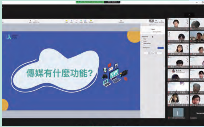
本院學生大使專心學習傳媒功能。TWGHs Student Ambassadors learnt the functions of the media attentively.