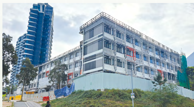
位於馬鞍山落禾沙里的過渡性房屋項目「樂和·東寓」 Transitional Housing Project "T-Loft@Lok Wo" on Lok Wo Sha Lane in Ma On Shan