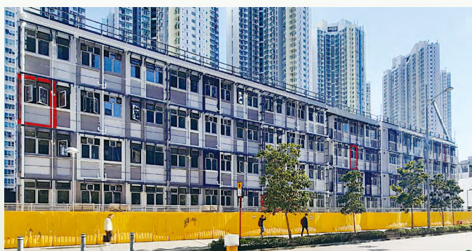
位於啟德沐安街的過渡性房屋項目「啟德·東寓」 Transitional Housing Project "T-Loft@Kai Tak" on Muk On Street in Kai Tak